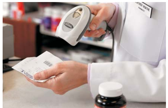
Pharmacies can scan prescriptions with a quick press of the button, enabling cost-effective maintenance of prescription records to meet regulatory requirements — without the high cost of administering a paper storage process.

With digital imaging, pharmacies can meet regulatory requirements for maintaining prescription records without the associated cost and administrative burden associated with paper storage. The Symbol DS6707 enables the electronic capture of clear and legible medication prescriptions in seconds. And the video viewfinder allows even novice users to capture images properly the first time — providing an electronic archive at the press of a button.