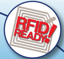
RFID Designed Printer