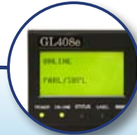
Large LCD Display Panel